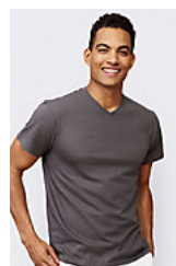
SOL'S VICTORY 11150